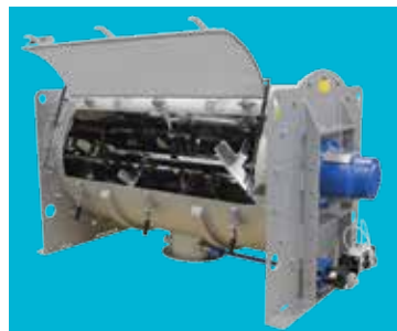
Large inspection door and easy-to-clean interior