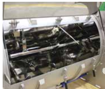
304L / 316L stainless steel chamber internally polished