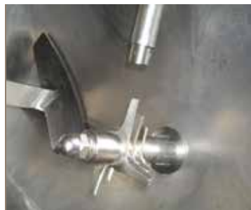
Liquid injectors and choppers